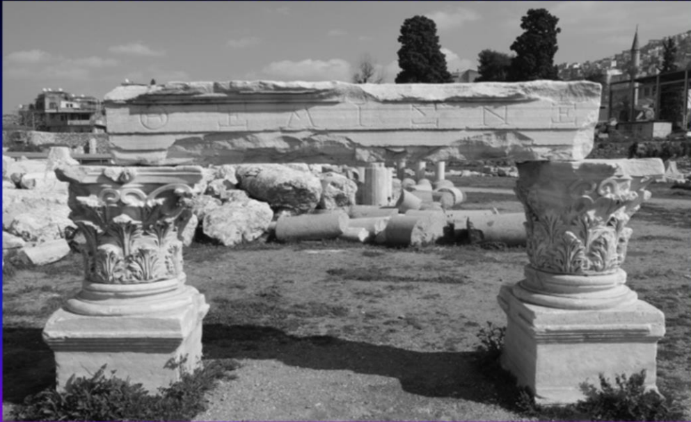
The Agora of Smyrna (columns of the western stoa)