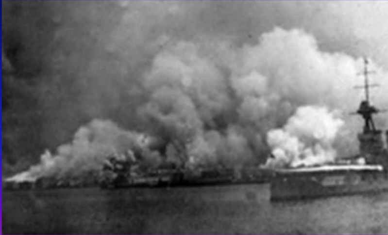
The Great Fire of Smyrna, September 14 th , 1922

SMYRNA - “sweet smelling” (“sweet smelling sacrifice” or “sacrifice of myrrh [incense]” → modern day – Turkish City of Izmir – place of many massive persecutions, even up to the 1920s