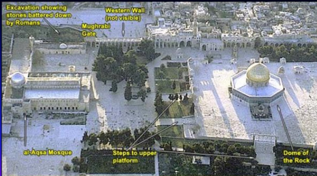
Southwest portion of the Noble Sanctuary (former Temple Mount)