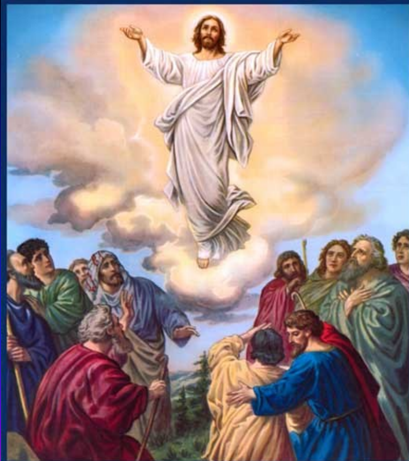
The Ascension of the Lord